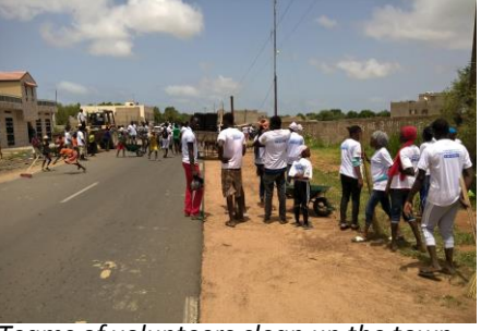
Teams of volunteers clean up the town