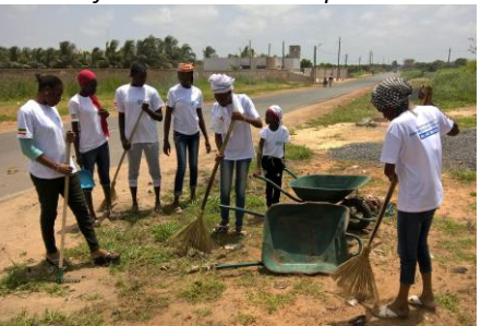
Cleaning up road-side waste