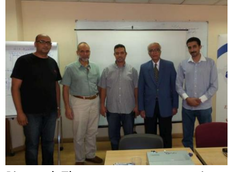
Pictured: The management team in Egypt attending a training course on Problem Solving and Root Cause Analysis.

Presbyterian Church visits Ghana factory