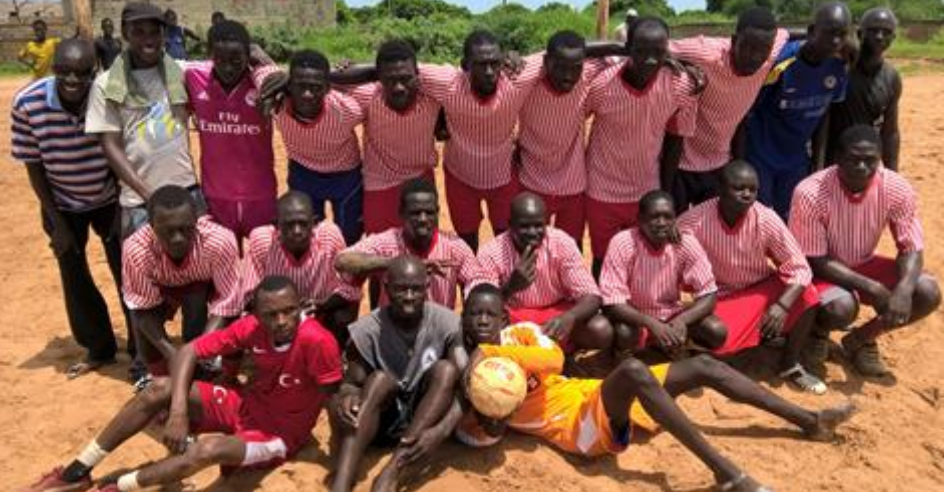
Pictured: Seidu's Mango Warriers looking relaxed prior to their 4-0 win over the Pelican's.