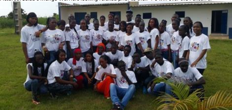
Pictured: the Blue Skies Senegal team get together to crown another season.