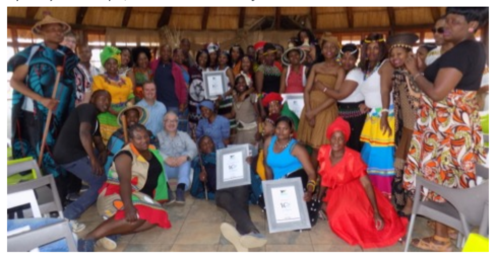
Above: people at Blue Skies South Africa in traditional costume for Heritage Day

By Waydu Nhlapo, Blue Skies South Africa