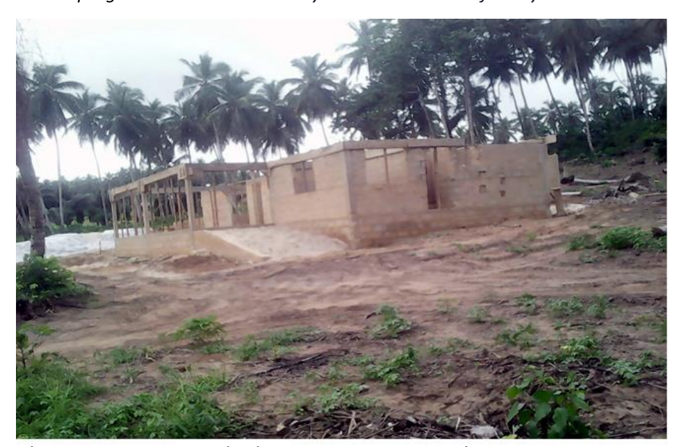
Above: progress at Nawule Clinic near to Jomorow in the Western Region.