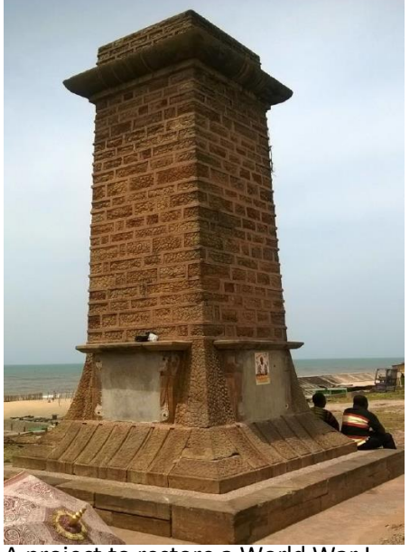
A project to restore a World War I memorial in the James Town area of Accra is under way. The project is being led by JustGhana and has received donations from a number of organisations including Blue Skies. The memorial tower which was built around 1922 to commemorate the fallen heroes of the First World War, has suffered neglect over the years.