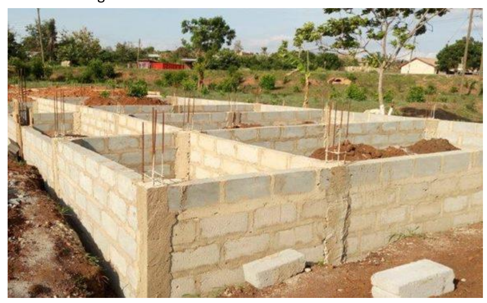
Above: progess at Chinto Community School near to our factory in Dobro

Work on our 2016 Foundation projects is making good progress. This year's projects include a three classroom block, staff common room, office and store for Chinto Community School near to our factory in Dobro, a clinic for a coconut growing community in the Western Region of Ghana, a new classroom block for a papaya growing community and the return of the School Farm of the Year Competition. Work on most projects is expected to be completed in time for the next Foundation Board meeting in June.