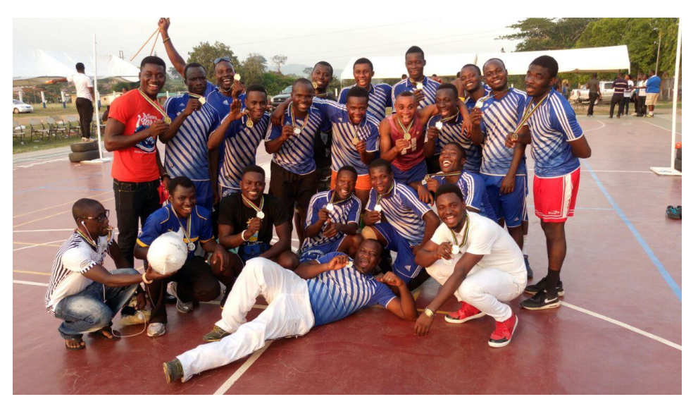
Above: The Pelican Spikers basking in the glory of their win!