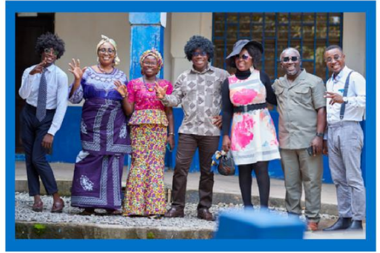
Wednesday: Old School Wednesday

On the 7th June, which marked the birthdate of the Chairman, Staff adorned themselves in Blue Skies branded Shirts and the Blue Skies cloth to celebrate and honour our Founder, the Okunini! (Legend).