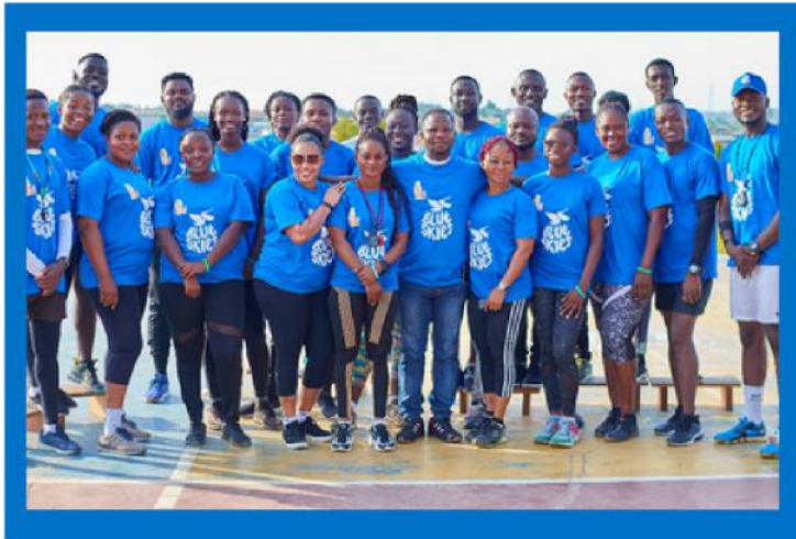
Thursday: Sporty Thursday

The theme for outfit of the day was old school. With the Chairman being a Baby Boomer, why not go back in time?