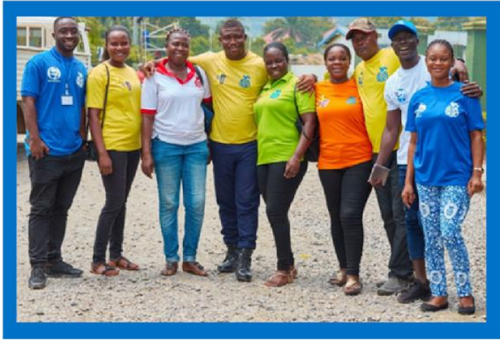
Tuesday: We are Blue Skies!

On the 7th June, which marked the birthdate of the Chairman, Staff adorned themselves in Blue Skies branded Shirts and the Blue Skies cloth to celebrate and honour our Founder, the Okunini! (Legend).