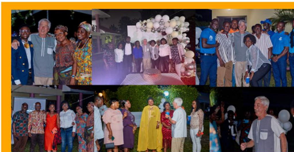
Friday Night: Dinner & Party

The Chairman visited the Dobro School built by the Foundation in 2013 to support the cleaning and painting activities carried out in the school by staff. The Founder has been a source of inspiration to the Dobro community in which the factory is sited.