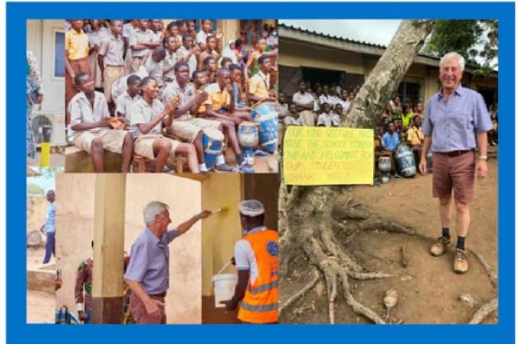
Friday: Traditional Friday

As an avid promoter of good health and exercising, Blue Skies Ghana went sporty on 9th June to honour the Founder and his love for sports.