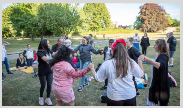
On the 14th July, the team at Blue Skies Corby joined together to host a summer picnic. Almost 100 people who work in the Blue Skies company and their families gathered at the picnic, where they enjoyed the summer weather, delicious food and each other's company. Happy faces, and feeling recharged and ready for the remaining busy summer period!