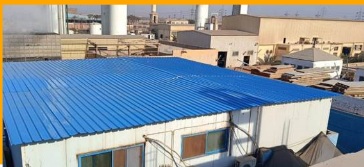
Contributed by: Ahmed Nabil, Technical supervisor

Blue Skies Egypt recently identified a serious issue with the gym roof panels, which caused water leakage onto equipment, creating a safety hazard and affecting machine functionality. Following discussions with the General Manager, prompt action was taken to replace the roof panels. The upgrade prioritises employee health and safety, ensuring a secure and fully functional gym environment.