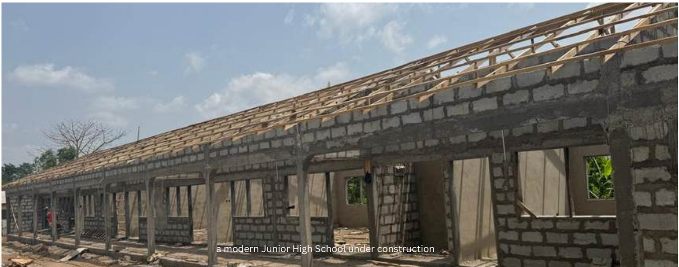
a modern Junior High School under construction

Construction of a modern Junior High School for the Panpanso Krokese Community is well underway, with the project now at the roofing stage and set for completion by May 2025. Approved by the Foundation Board last year, the facility will feature three classrooms, an ICT center, a staff common room, washrooms, and a mechanized water system to support academic activities. The project has already sparked increased enrollment and enthusiasm within the community, reinforcing a commitment to education and development. Once completed, it will provide vital learning opportunities and stand as a testament to collaboration and progress.