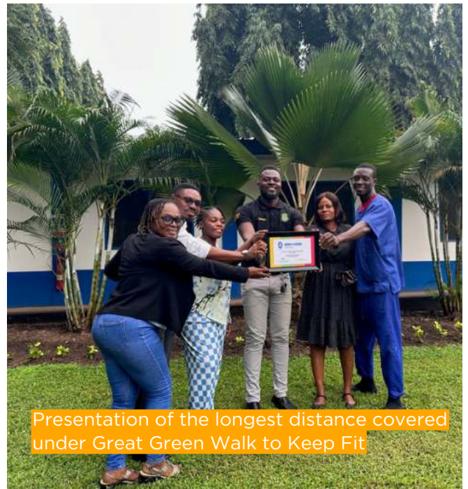
Presentation of the longest distance covered under Great Green Walk to Keep Fit

On 6th July 2024, the Blue Skies Keep Fit Club joined forces with the El Wak Keep Fit Club and others for a remarkable 17.5km Republic Day Walk, aptly named the Ghana Peace Walk. This significant event took place on the principal streets of Accra, attracting over 1,000 participants from across the nation and beyond. The primary goal of the walk was to promote peace before, during, and after this year's general elections. Among the enthusiastic crowd, around 40 members from Blue Skies energetically participated in the walk, showcasing their commitment to fitness and peace. The event not only promoted physical health but also fostered unity and friendship among diverse groups, highlighting the spirit of togetherness and the importance of maintaining peace in Ghana.