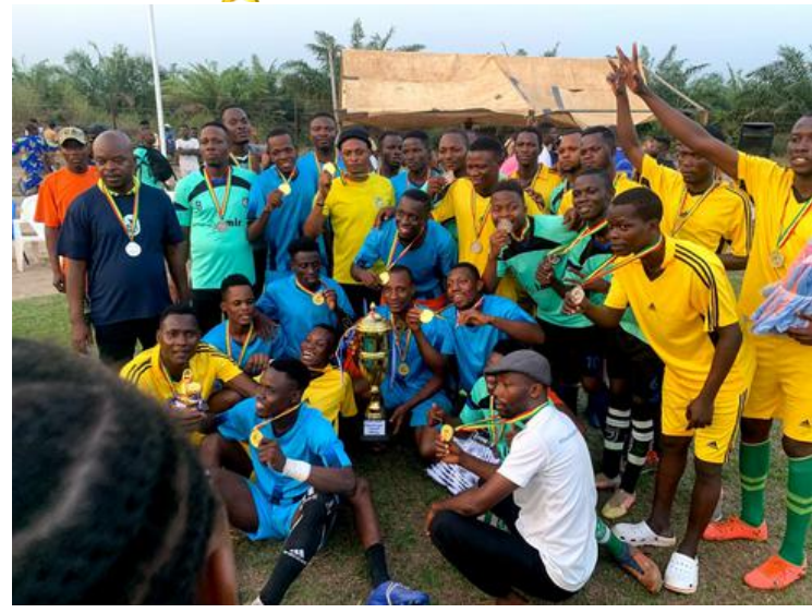
VICTOIRE FC (in Blue), PHENIX FC (in yellow), and TIGRE NOIR FC (in green) celebrating the end of the league season together.

Blue Skies Benin recently enjoyed celebrations of the 4th anniversary of Blue Skies Benin first export. Benin exported its first AKE on Air France, on 23rd February 2020. This year, the day was celebrated on Tuesday 27th February 2024. The team enjoyed a full day programme consisting of various sporting activities, which encouraged lots of participation and competition!