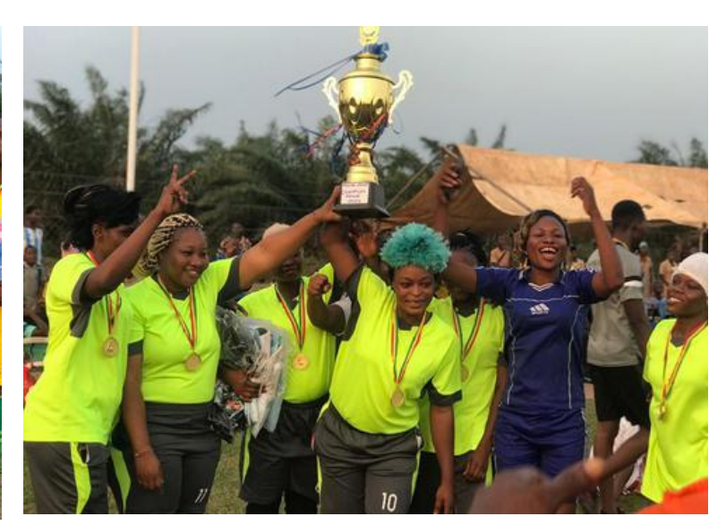
AGODJIE FC celebrating.

Congratulations to Blue Skies Benin on celebrating their 4th Anniversary.