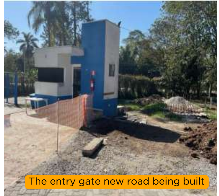
The entry gate new road being built

The visit was hugely important to understand how the site can expand looking at how we can maximise limited space. The team have done a great job at facilitating space to store key warehouse items and free up areas. Efficiencies have also been reviewed, including looking at the traffic flow in and out of the factory. The new entry gate road is due for completion very soon which we are excited to see.