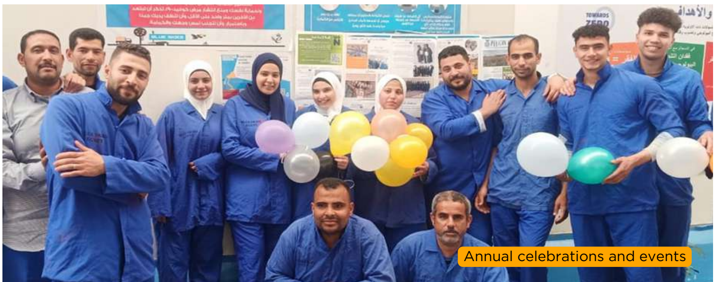
Annual celebrations and events