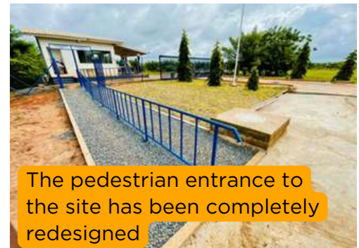
The pedestrian entrance to the site has been completely redesigned