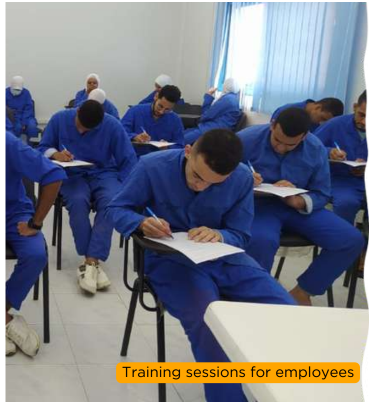
Training sessions for employees