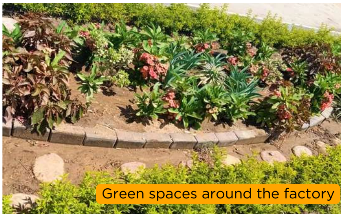
Green spaces around the factory

The team also places great emphasis on training programmes that contribute to meaningful work. Through regular refreshers on essential topics such as cleaning methods, cross-contamination prevention, hygiene rules, and fruit preparation, they ensure that employees are equipped with the knowledge and skills required for their roles, fostering a happier and more productive team.