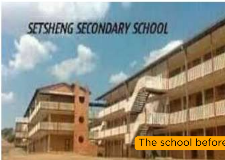
The school before works began

At present, the school does not have any classrooms and other essential facilities until phase 2 of building the new school be in place. The project will hopefully see more progress in the coming months.