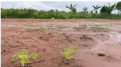
The redevelopment of this space includes the planting of lawns, layout of trees and redesigned walkways.